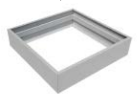
Surface mounting aluminum frame L600xW600xH70mm