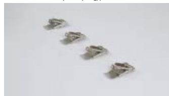
Gypsum Board Recessing Clips